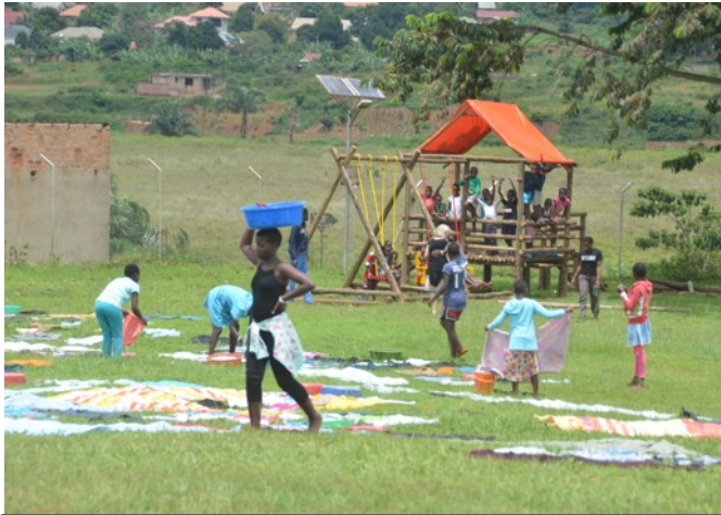
NEW PLAYGROUND AFRICAN CHILDREN’S CHOIR PRIMARY SCHOOL

Two “fix it/construction” teams committed to repainting Jace Primary School in the slum, as well as building a playground at the same school as well as The African Children’s Choir Primary School.