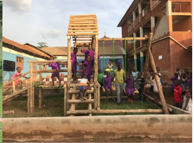
NEW PLAYGROUND JACE PRIMARY SCHOOL IN THE SLUMS OF KAMPALA