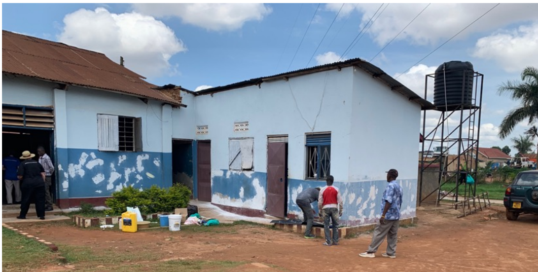
NEW PAINT JOB JACE PRIMARY SCHOOL IN THE SLUMS OF KAMPALA