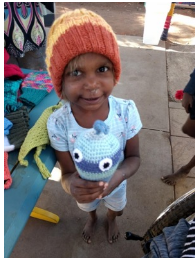
At the Purple House, (Western Desert Dialysis), Alice Springs

This year we have received 100kgs of delightful handmade knits from 8 donor groups: